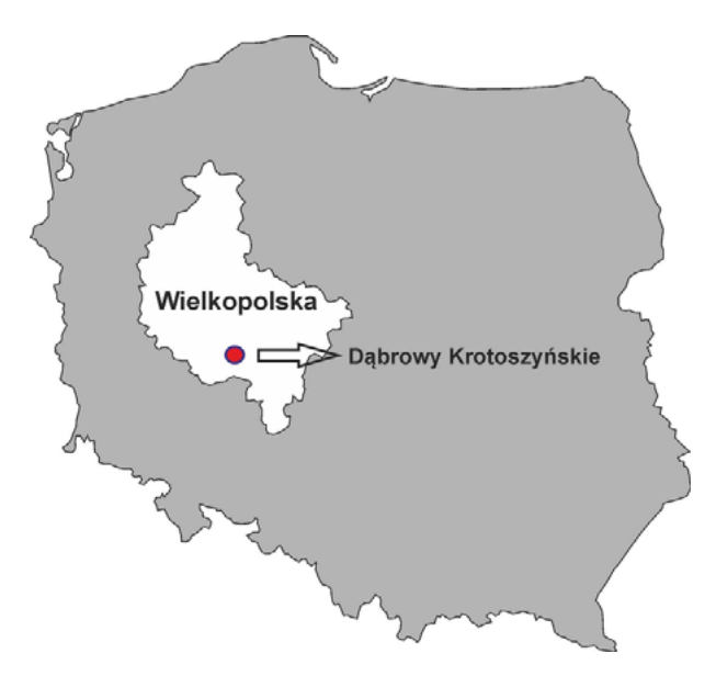
Fig. 1. Location of the NATURA 2000 Dąbrowy Krotoszyńskie area in Poland.

On par with natural ecosystems and agrocenosis should also be the protection of traditional folk knowledge and